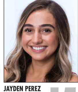
So. | 5-8 | G Las Cruces, N.M. Onate HS