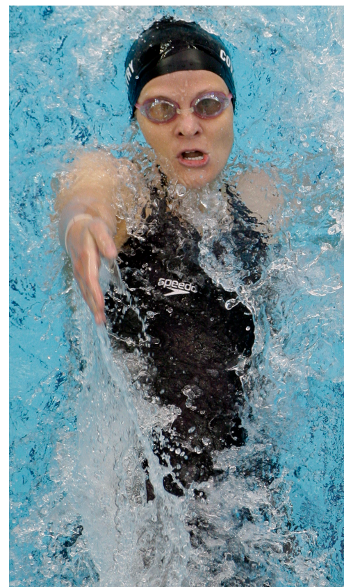
Olympic gold medalist Kirsty Coventry earned the second-most SEC titles by an Auburn swimmer.