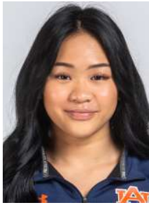
SUNISA LEE Fr. • AA • 5-0