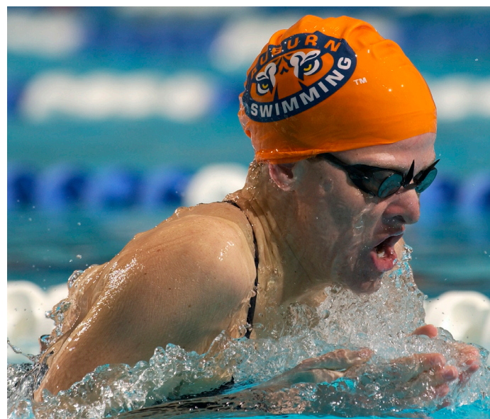
Olympic gold medalist Kirsty Coventry earned the second-most SEC titles by an Auburn swimmer.