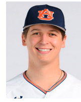
21 TRACE BRIGHT