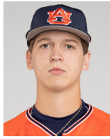
21 TRACE BRIGHT