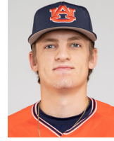
6 MATT SCHEFFLER