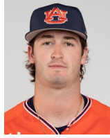
11 CHASE HALL