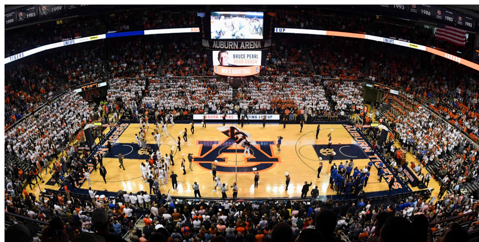
Auburn Arena during a game, showing the court and spectators.