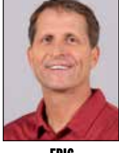
ERIC MUSSELMAN Head Coach